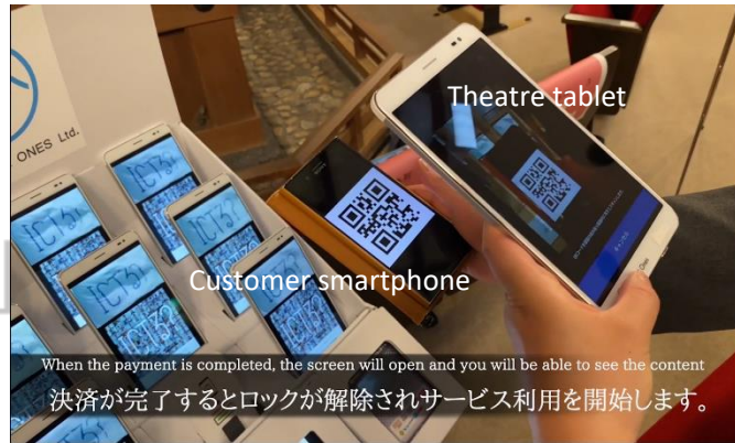
Customers pay the fee using QR code, etc.

When the payment is completed, the screen will open and you will be able to see the content 決済が完了するとロックが解除されサービス利用を開始します。