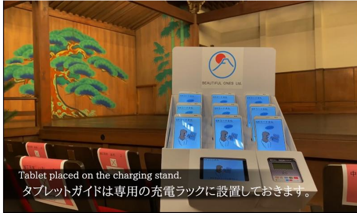
Tablet rental stands in a theatre.